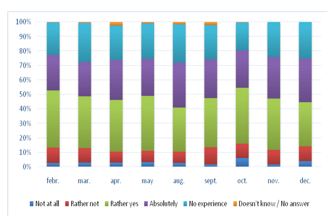
Graph 1: All in all how statisfied are you with the service of the Government Windows?

The relations between the state and its citizens are largely influenced by the burden placed upon customers by the administrative procedures they encounter. Some problems occurred with customer orientation, time and cost, non-standardised service qualities, and non-interoperable operating and management systems, so as to say all administrative burdens. Customer service became unsustainable, operating in a fragmented and inefficient manner.